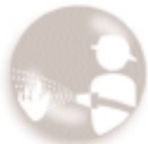
Fire and Rescue Safety